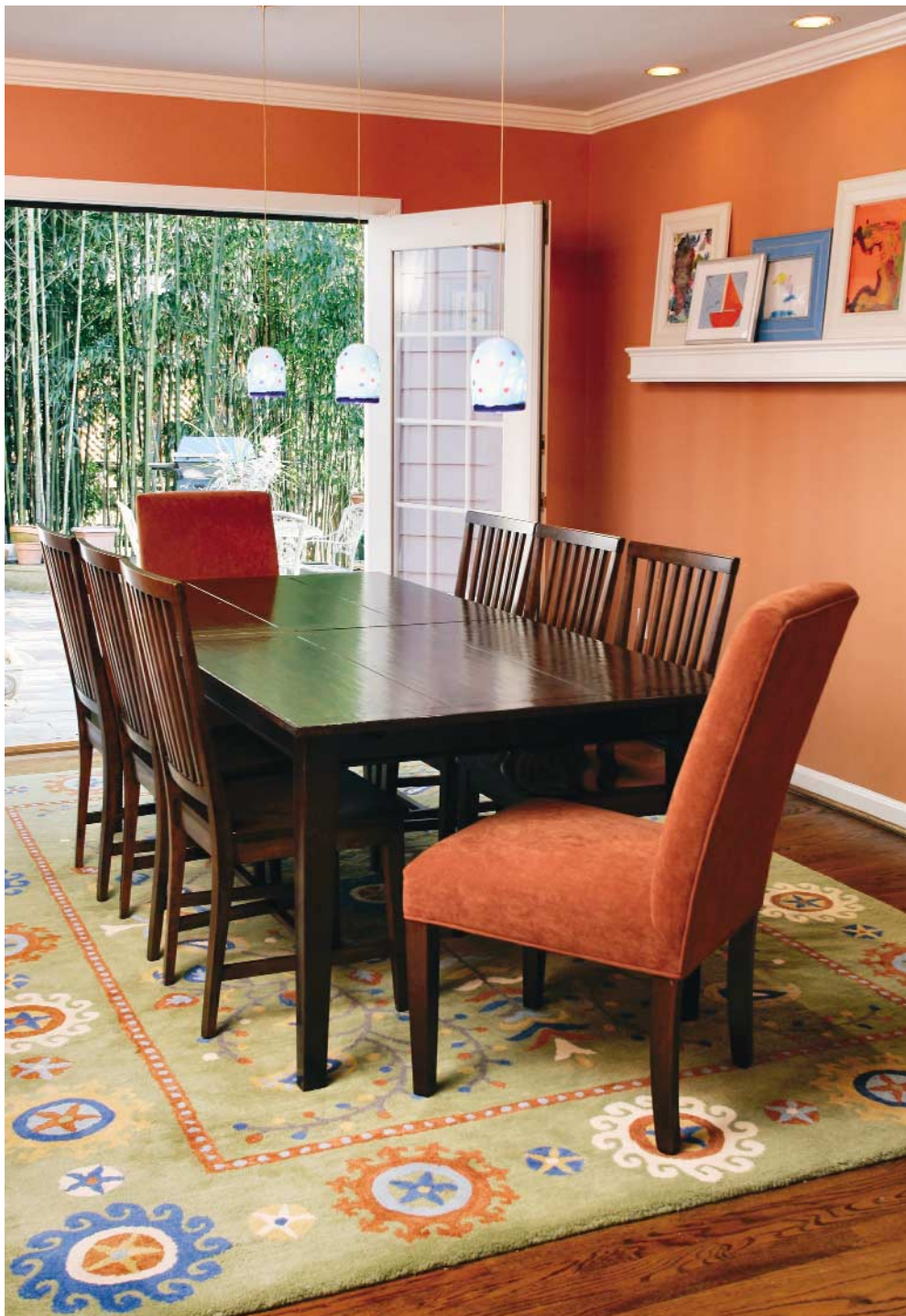
BELOW: Close-up of decorative Murano glass pendants over dining table.